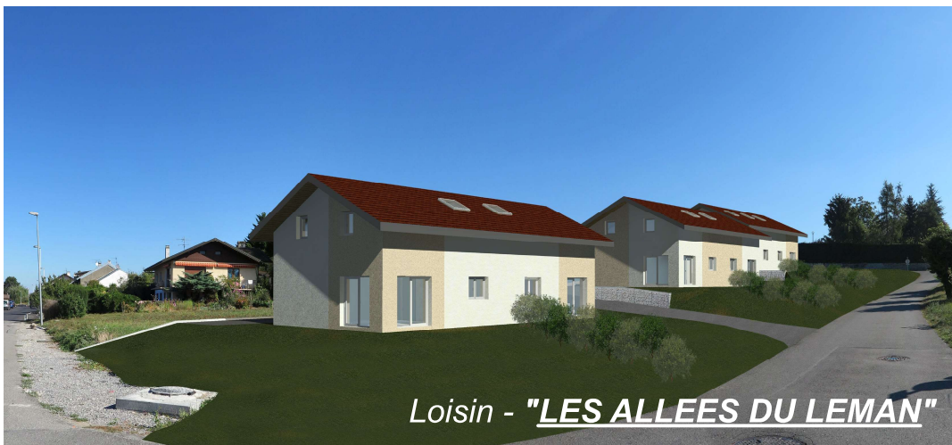
Loisin - "LES ALLEES DU LEMAN"